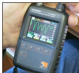
Photo shows the antenna analyser used by Norman M0FZW to test the long wire into the club shack. Ask for a demo on how it works if you are considering this as an option at home.